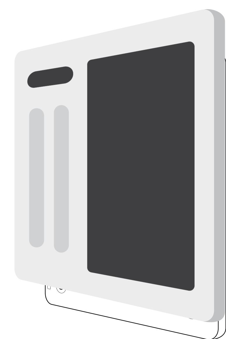
Attach Second Generation faceplate to the base